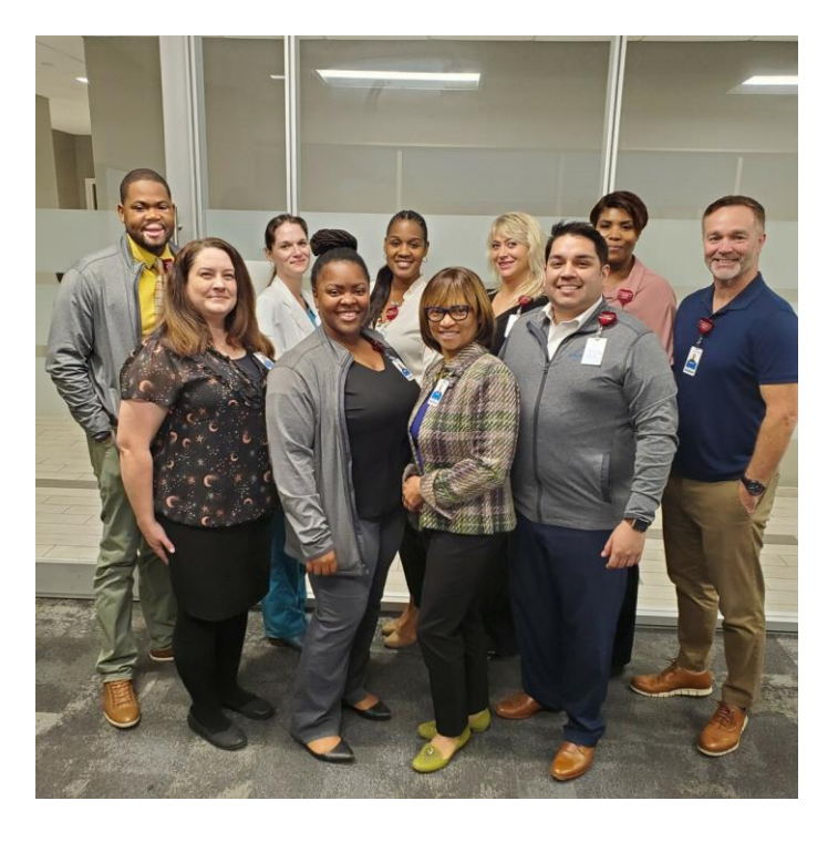
AdventHealth Community Care Team

*Total patients served for Orange, Osceola and Seminole County in 2019